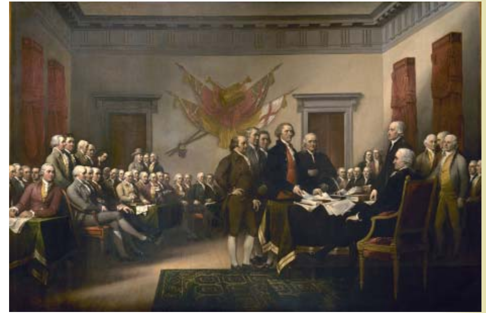
"We hold these truths to be self evident, that all men are created Equal."

R They created a new concept of justice for an independent nation.